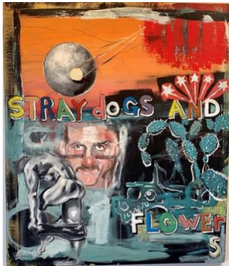
Stray Dogs and Flowers, 2016 116 x 99cm $35,000