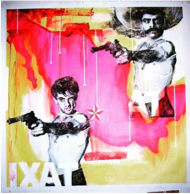
IXAT, 2008 182 x 182cm $45,000