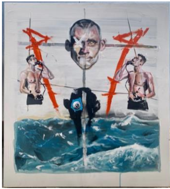
TWA Flight 800, 2022, 90 x 100cm, $30,000