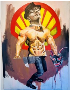
Shell, 2012 122 x 91cm $35,000