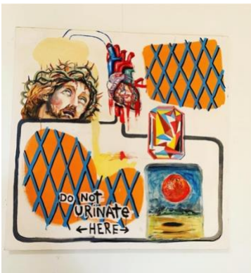
Do not urinate here, 2008 100 x 100cm $30,000