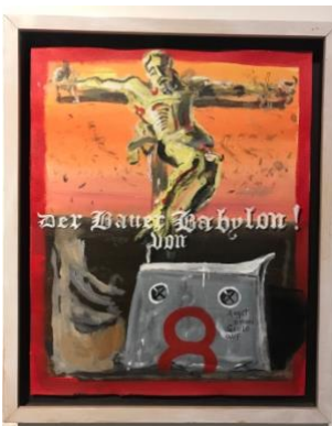
Der Bauer von Babylon, 2016 47 x 57cm $14,000