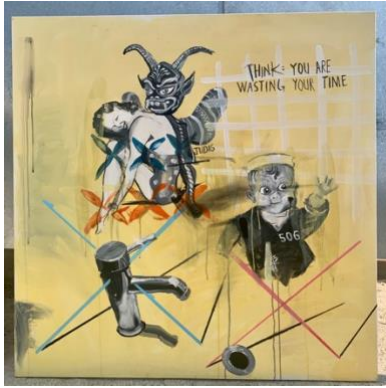
It's Time for Sex with Strangers, 2019 100 x 100cm $30,000