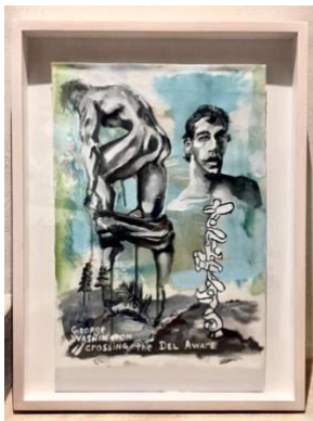
Washington Crossing the Del Aware, 2019 55 x 73cm $14,000