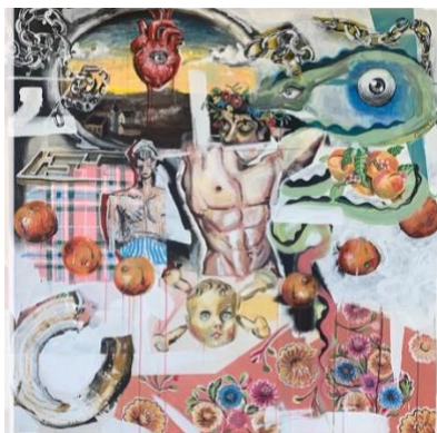
For Julio Galan, 2022 150 x 150cm $55,000