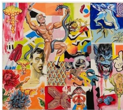
Watch the Stars, 2022, 80 x 70cm $18,000