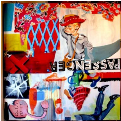
Passenger Side, 2014 120 x 120cm $35,000