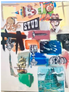
Brother's Cup, 2022 120 x 150cm $35,000