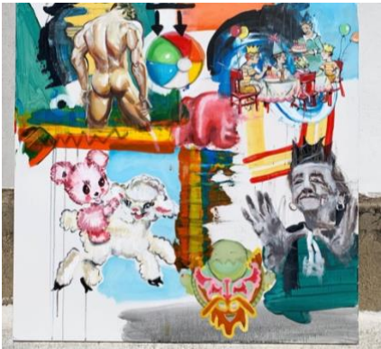
Louise Bourgeois, 2021, 100 x 100cm $30,000