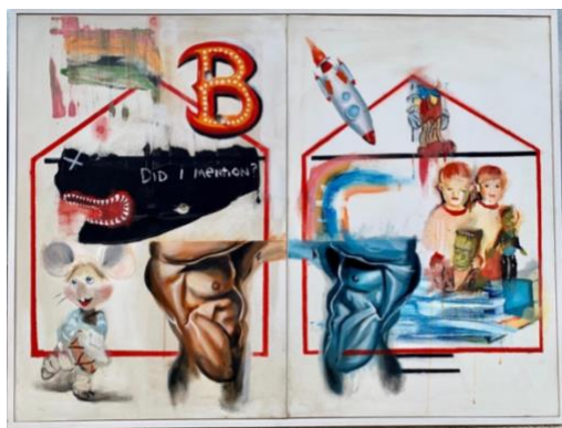
Bastards, 2015, 95 x 125cm $35,000