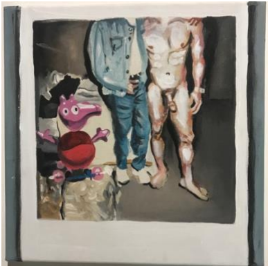
Untitled, 2020 30 x 30cm $12,000