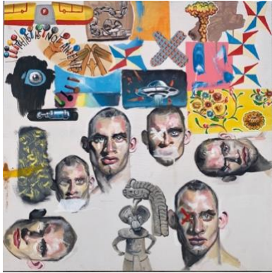
Untitled, 2022 100 x 100cm $30,000