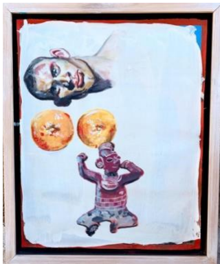
Untitled, 47 x 57cm $14,000