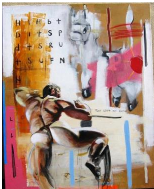
Heaven is here, 2007 182 x 142cm $55,000