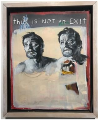
This is not an exit, 2020 47 x 57cm $14,000