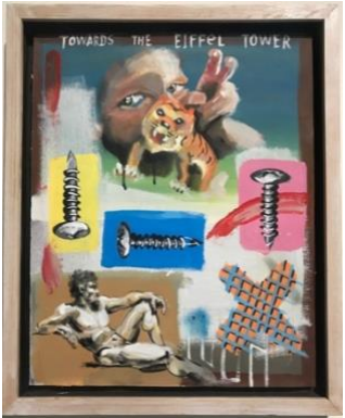
Towards the Eiffel Tower, 2022 47 x 57cm $14,000