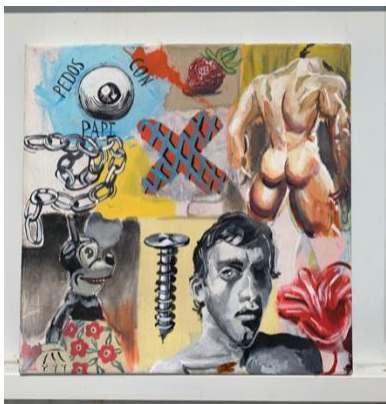
Pedos con Papi, 2022, 40 x 40cm $12,000