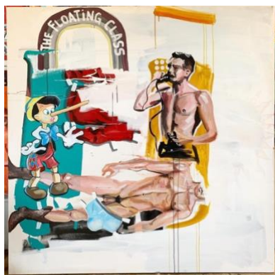
The Floating Class, 2020 170 x 170cm $55,000